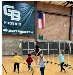
UWGB athletes played volleyball, basketball, soccer, and football with students in the Kress Center.