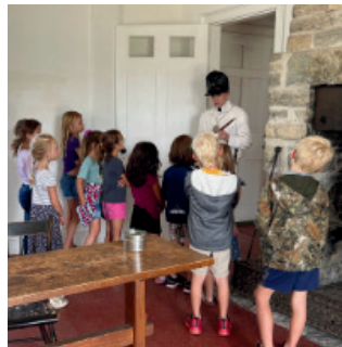
Camp BRAVE students asking questions about the fife and drum corps at Heritage Hill, Green Bay.

Registration for second semester opens Dec. 1.